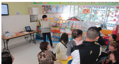
Parents actively participated in the "Character First" parenting course

Caritas Integrated Family Service Centre - Tsuen Wan had organized two promotion campaigns with funding from Tsuen Wan District Council. Adopting the essence of positive psychology, the campaigns aimed to promote the building of character strength with the emphasis on moral education as the cornerstone of parenting and children development. The family core value of "appreciation and love" was promoted through various school-based education programmes as well as children and parenting groups in the community. The message was also highlighted in all the services provided for children and parents.