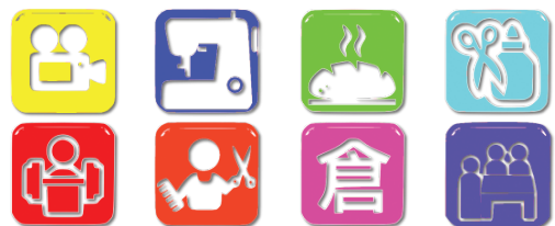
The trade skills taught in the project

To enrich the life of young people who received drug treatment at Caritas Wong Yiu Nam Centre, this three-year project was started in June 2013 and was supported by the Beat Drugs Fund Association. Employment orientation, job skills training, apprenticeships as well as counselling support were provided to the boys under treatment, in order to learn skills and build up their own career.