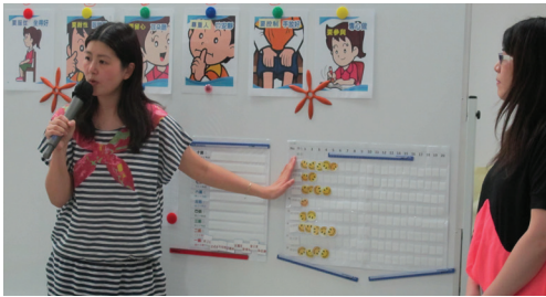
Effective behaviour management system in action