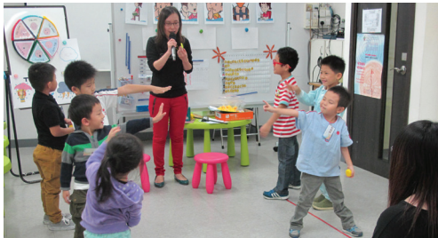
Collaboration skills trained through games