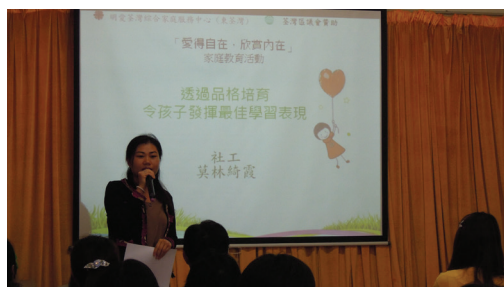
Campaign of "Love Freely, Appreciate the Inner Self" received positive feedback from the community