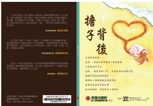
A collection on debtors' stories

This was a three-year project sponsored by Keswick Foundation. It aimed at rendering professional counselling to help debtors rebuild family relationship and a healthy life. The project also provided a professional training to social workers on debt counselling. Upon completion of the project, a research report on “The Financial and Social Exclusion of Debtors and Bankrupts” and a “Professional Debt Counselling Manual” were published for reference by the professionals. A collection of debtors’ stories was also compiled for the general public.