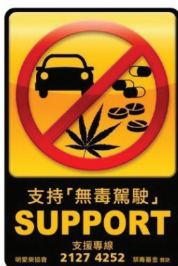
Publicity materials of "Say No to Drug Driving Project"