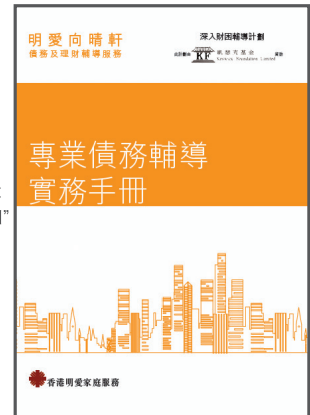
The first “Professional Debt Counselling Manual” in Hong Kong