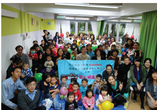
▲ A warm gathering organized by Alpha Appliances Limited for the deprived families after the Air-conditioners Donation Project