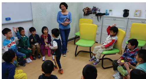
The character strength of "Care and Love" was built up from childhood