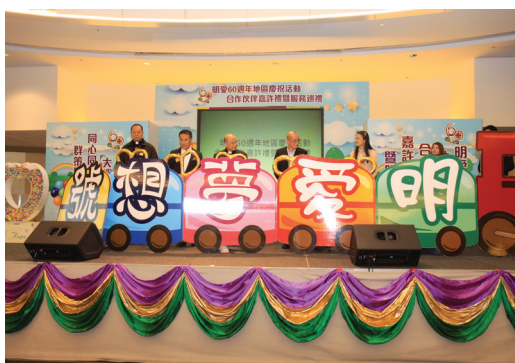
▼ Recognition ceremony for stakeholders cum services pilgrimage in celebration of the 60th Anniversary of Caritas

In celebration of the 60th Anniversary of Caritas - Hong Kong, Social Work Services units of Tsuen Wan / Kwai Tsing / Lantau District had jointly organized a cross-district programme to express Caritas appreciation to the stakeholders and partners. The event was held on 14 December 2013 and the programme included exhibition of winning entries in a drawing competition, game booths and performance by service users.